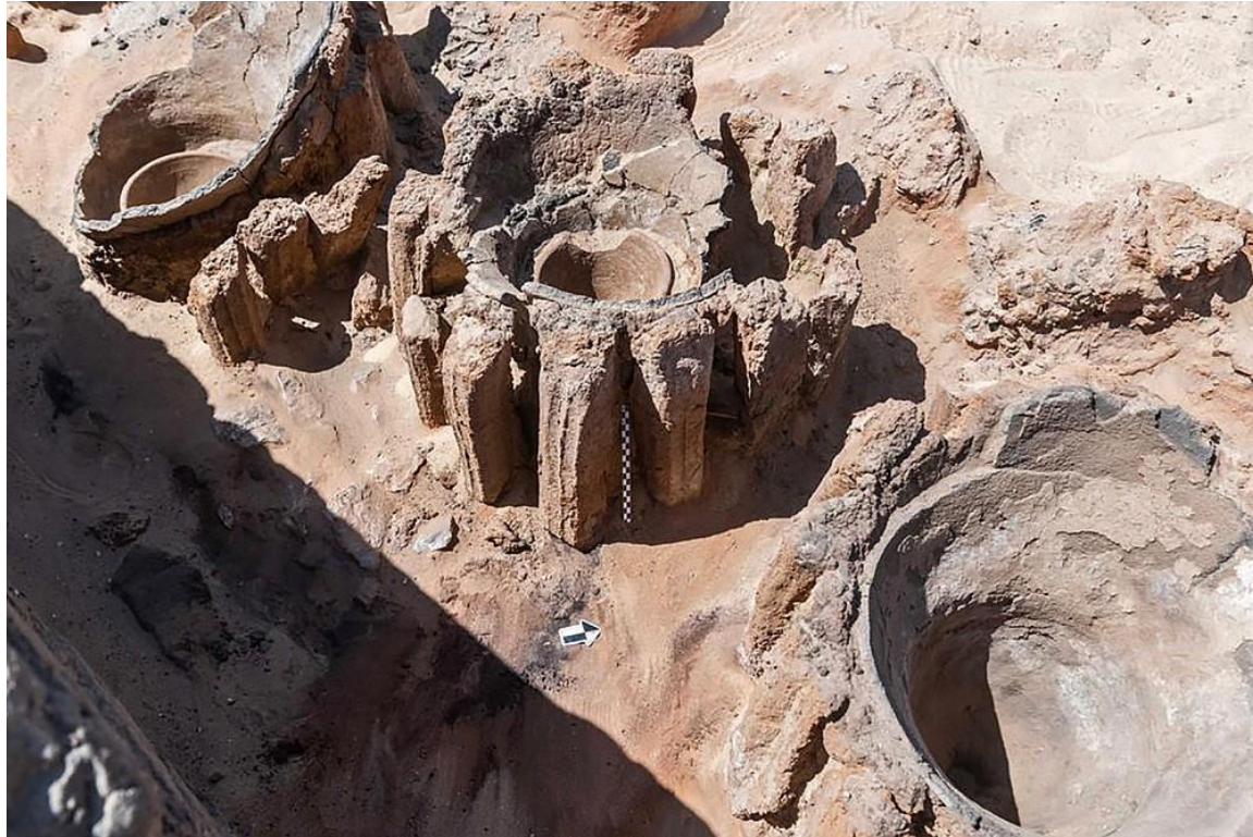
FIG. 1. THREE OF THE CERAMIC VATS USED TO MASH GRAINS AND WATER